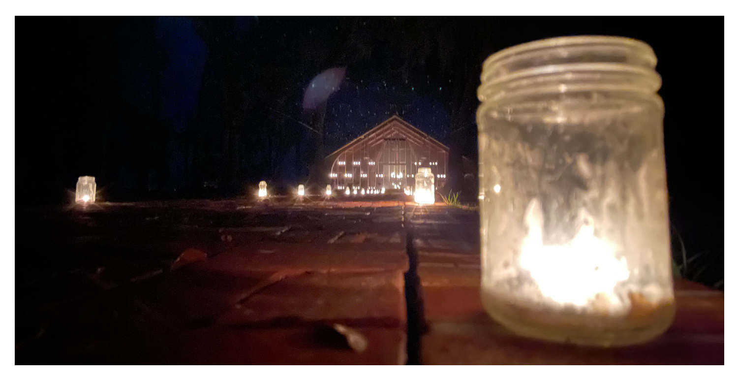
The 201st Convention of the Episcopal Diocese of Georgia - 51