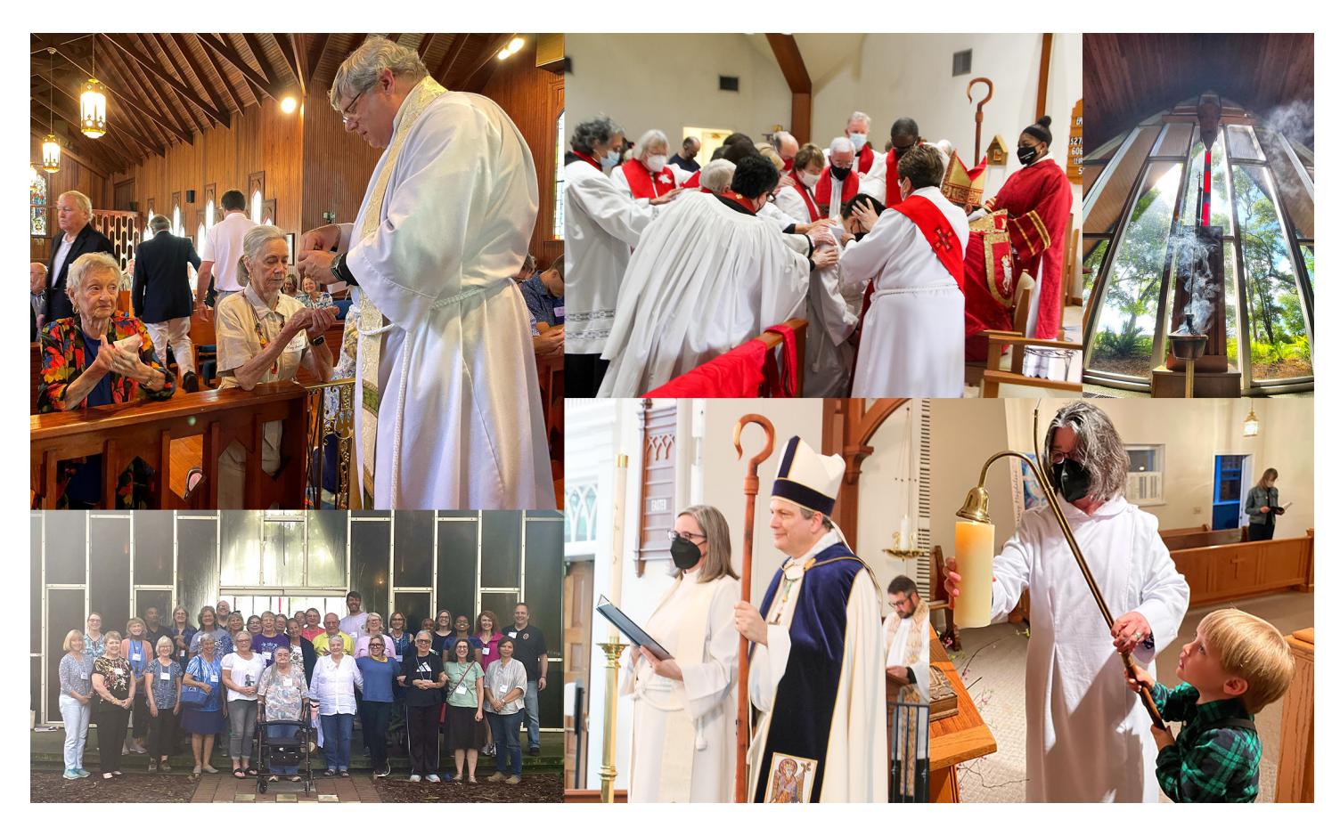
6 - The 201st Convention of the Episcopal Diocese of Georgia